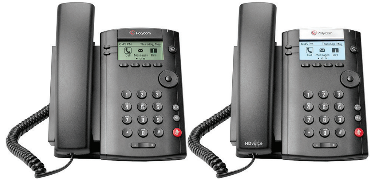
Polycom VVX 101 and Polycom VVX 201